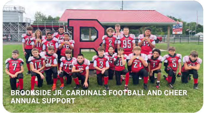
BROOKSIDE JR. CARDINALS FOOTBALL AND CHEER ANNUAL SUPPORT