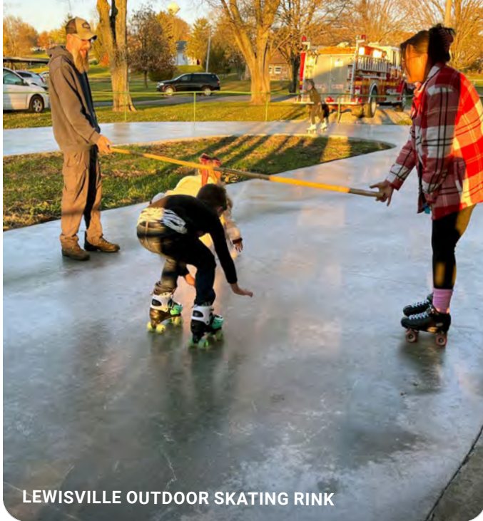
LEWISVILLE OUTDOOR SKATING RINK