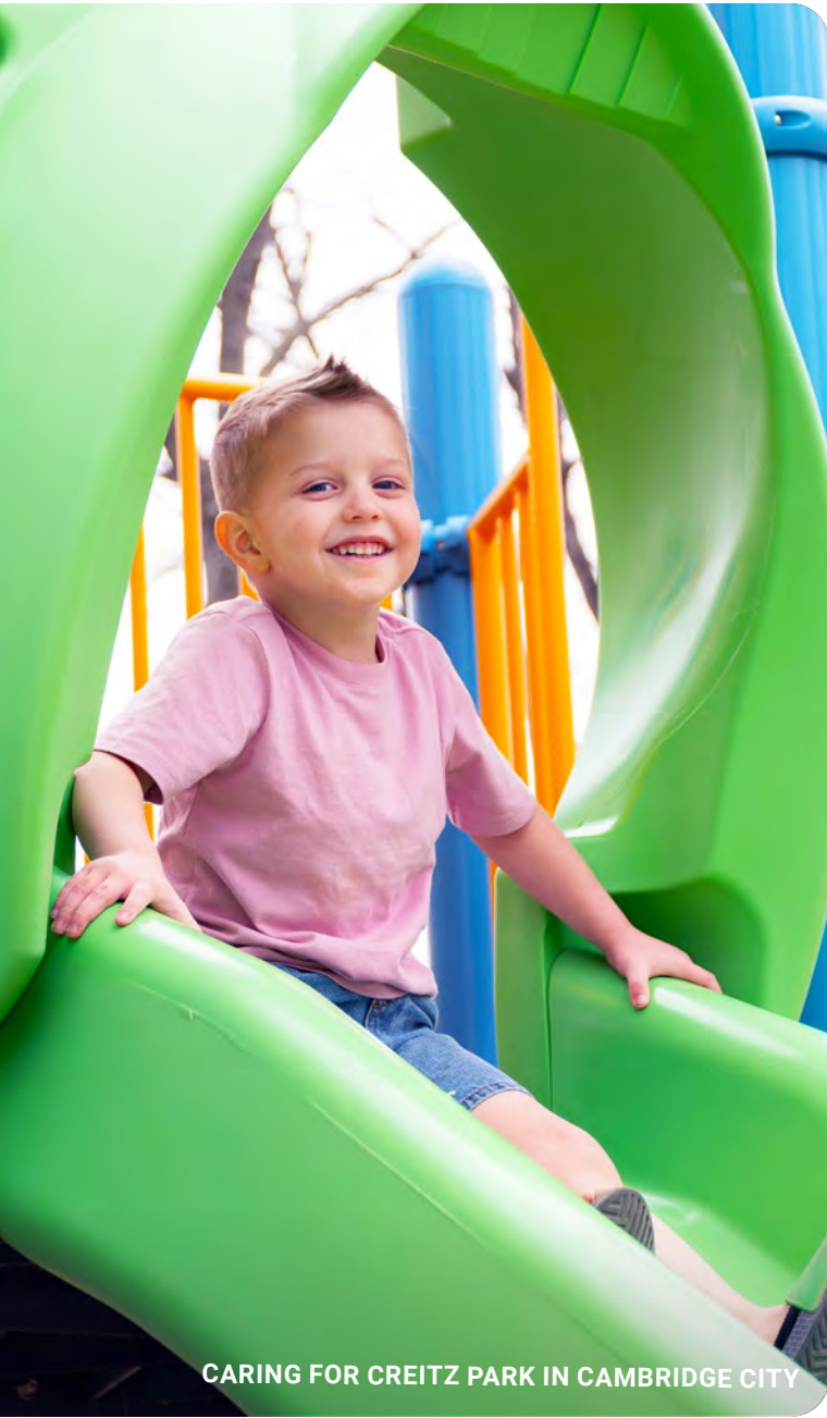
CARING FOR CREITZ PARK IN CAMBRIDGE CITY