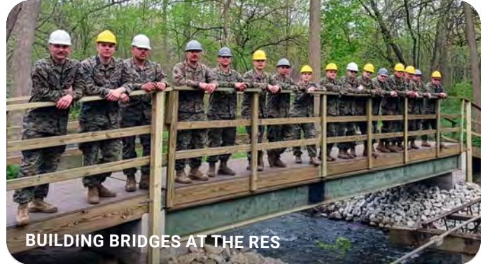
BUILDING BRIDGES AT THE RES