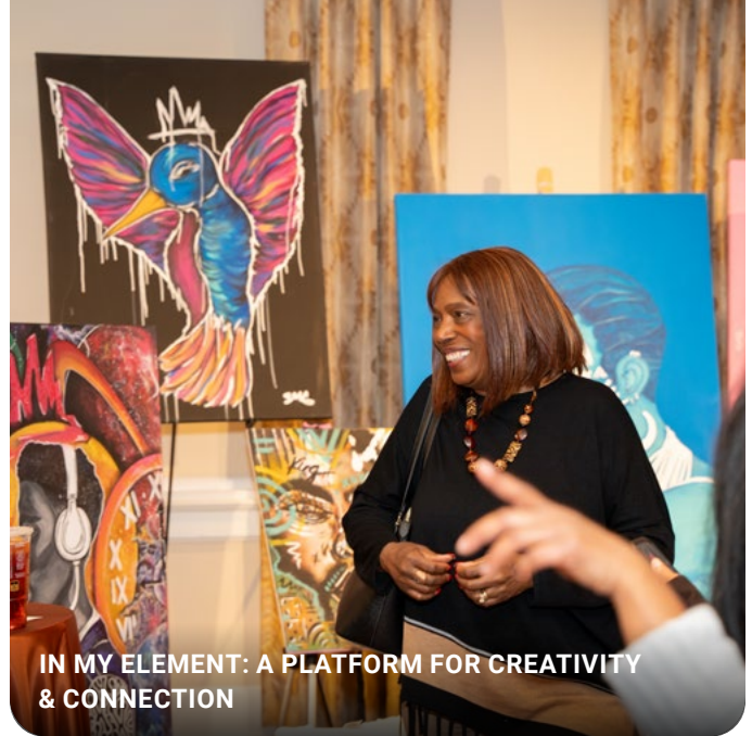
IN MY ELEMENT: A PLATFORM FOR CREATIVITY & CONNECTION