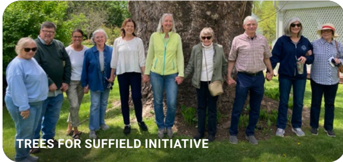
TREES FOR SUFFIELD INITIATIVE