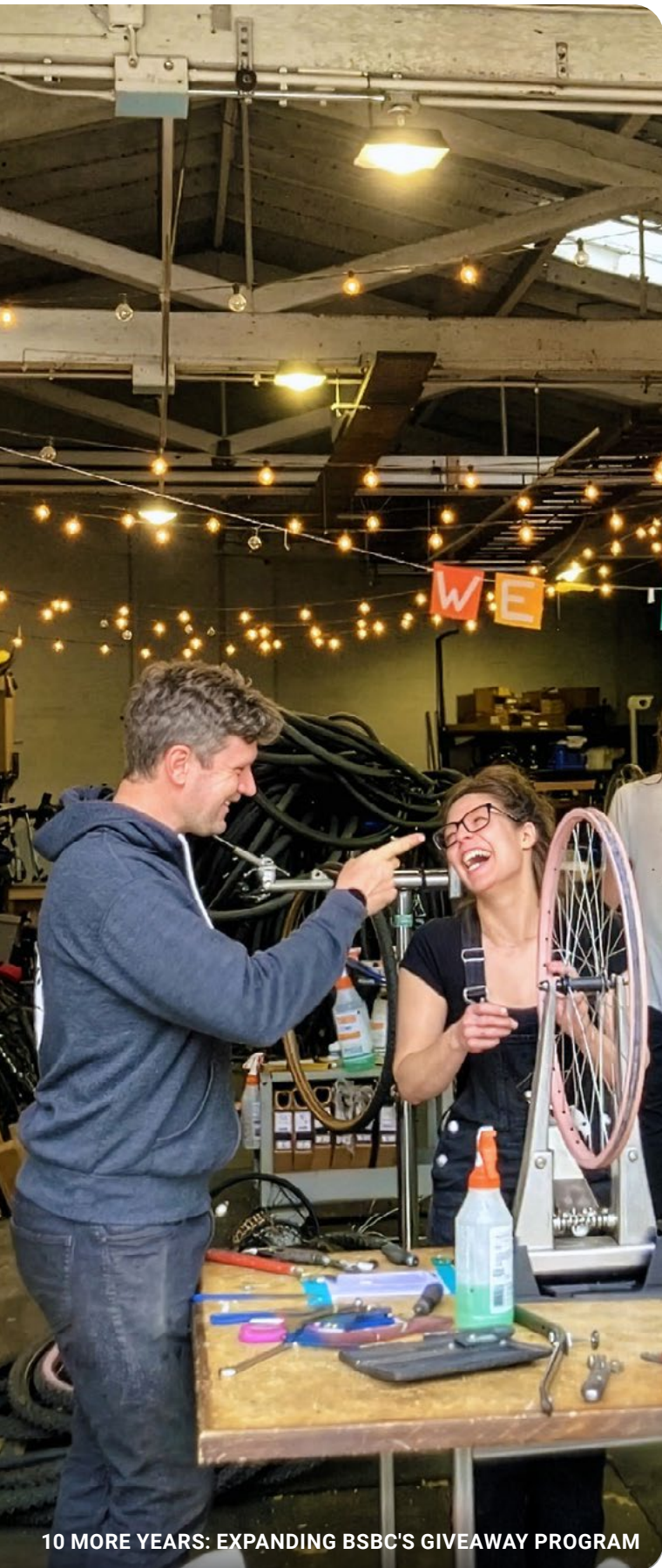
10 MORE YEARS: EXPANDING BSBC'S GIVEAWAY PROGRAM