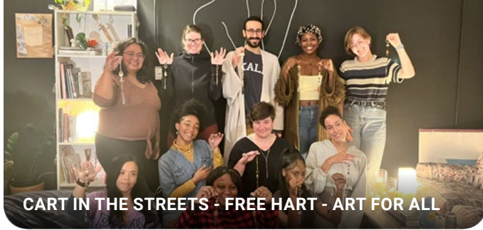
CART IN THE STREETS - FREE HART - ART FOR ALL